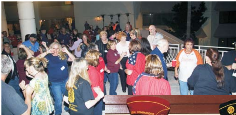
Everyone having some sun on the Karaoke Terrace