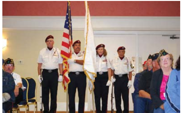
Earl E. Mitchell Post #29 Glendale Color Guard presenting Colors at Opening Ceremony