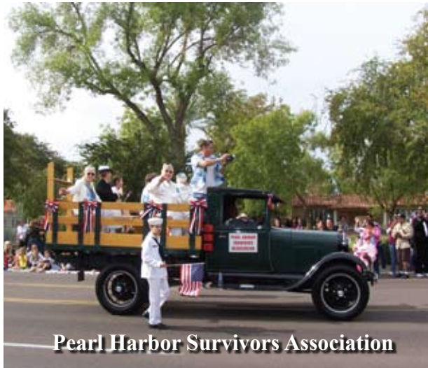
Pearl Harbor Survivors Association