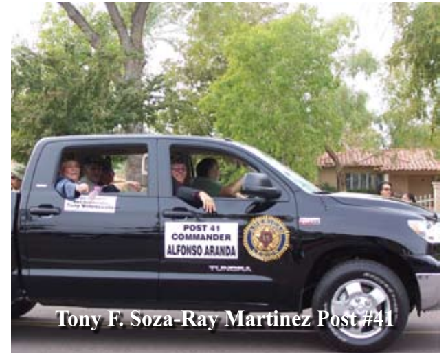
Tony F. Soza-Ray Martinez Post #41