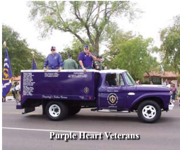
Purple Heart Veterans