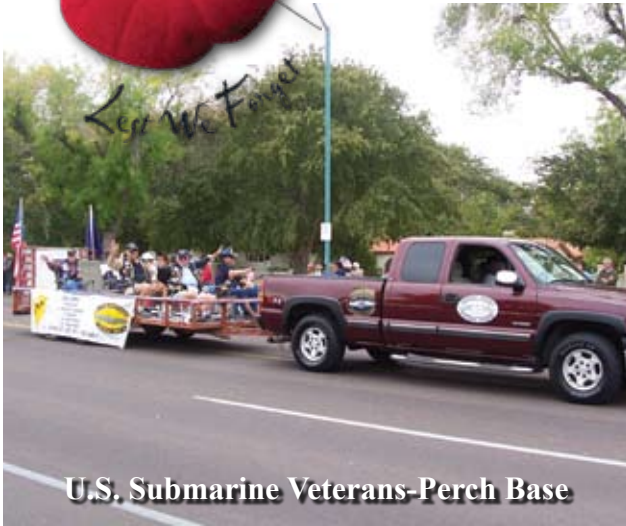
U.S. Submarine Veterans-Perch Base