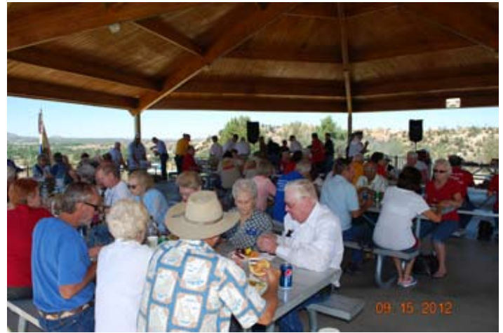
District 8 Legionnaires enjoy a picnic feast at the lake.