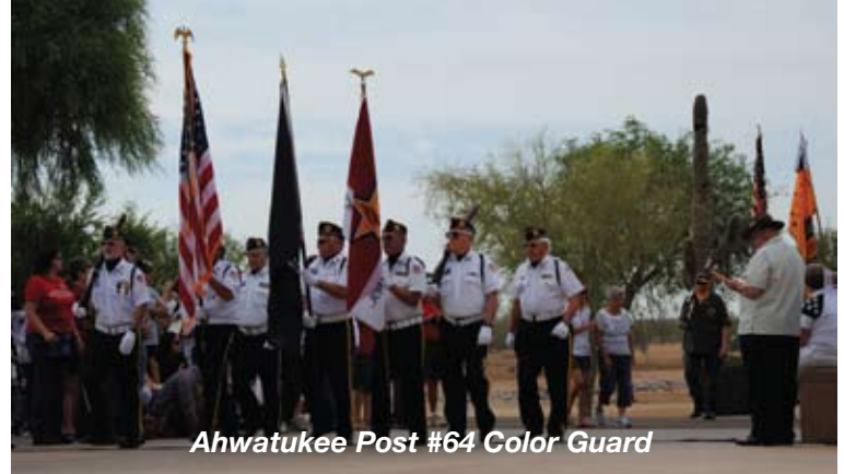
Ahwatukee Post #64 Color Guard