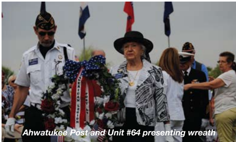
Ahwatukee Post and Unit #64 presenting wreath