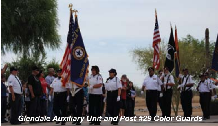
Glendale Auxiliary Unit and Post #29 Color Guards