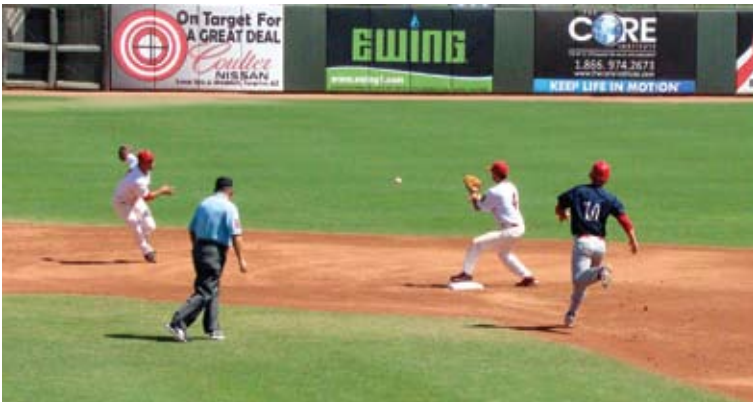
Is it going to be close?