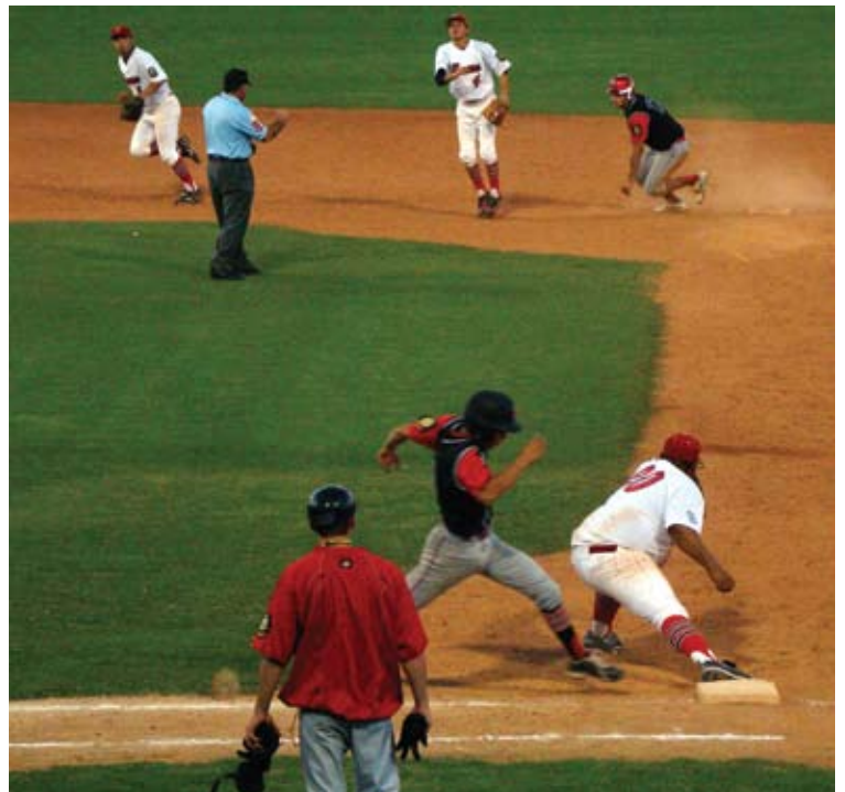
Turning the double play.