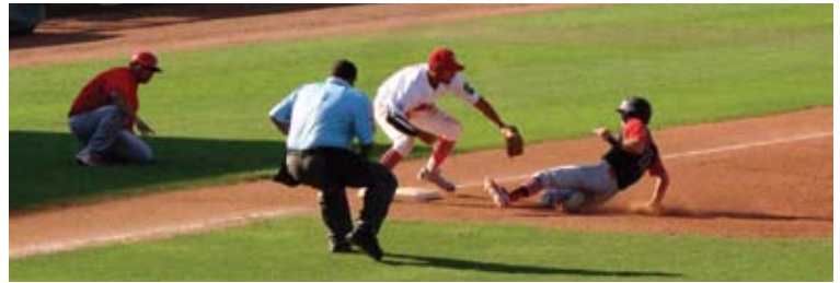
It's a close play at third.