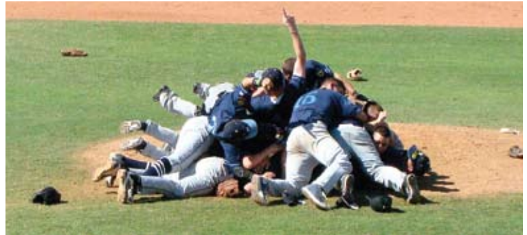
Mounds of joy! Petaluma celebrates their victory.