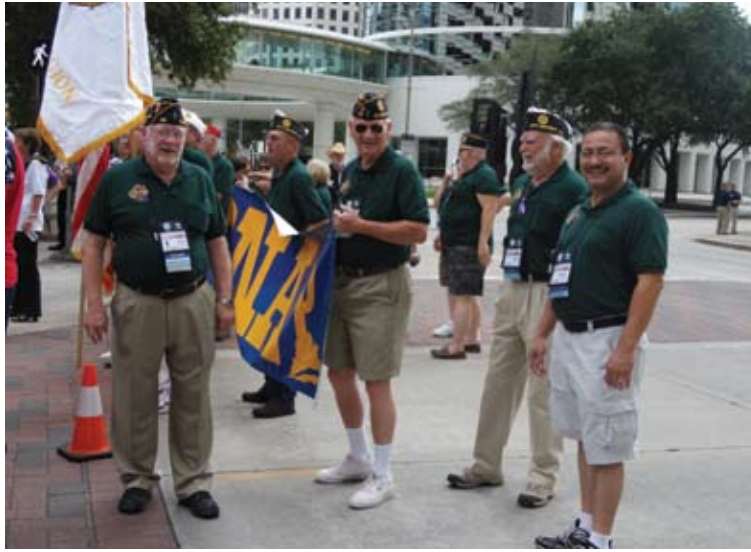
Let's get this parade going...it's HUMID out here!