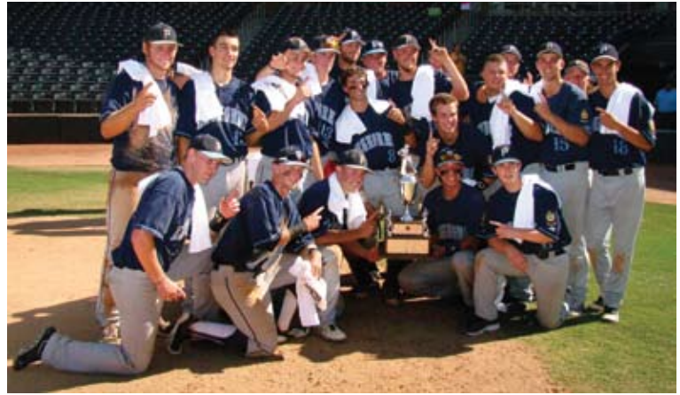
2013 Western Region Champions from Petaluma, California