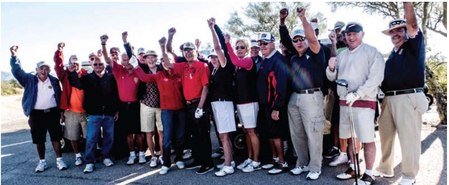
Our 2014 Fall Conference Golfers after a brisk morning of Golf.