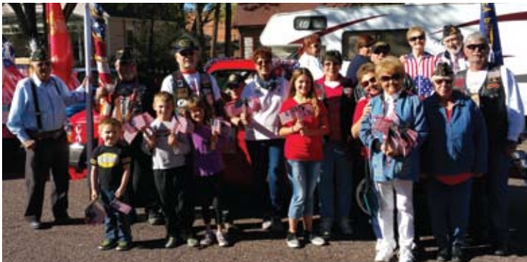
Getting ready for the Veterans' Day Parade in Prescott

The past couple of months have been very busy in the northern part of the state. On September 16th and 17th, I volunteered at the Stand Down in Prescott Valley held at Tim's Toyota Center; attended the District 6 Meeting/Picnic and the District 7 and 8 Meetings. I have also visited a few of the Posts in my area.