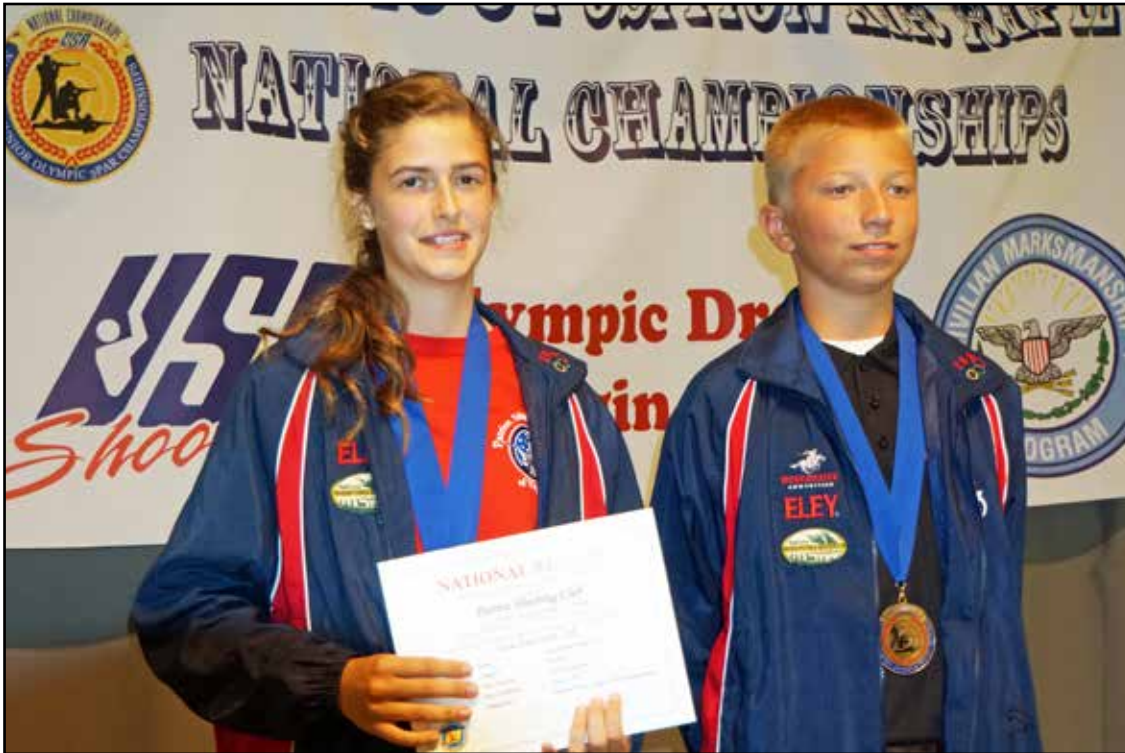
Junior athletes who compete and win in major 3PAR Precision Class National Championships are already well advanced in following the Olympic Path.