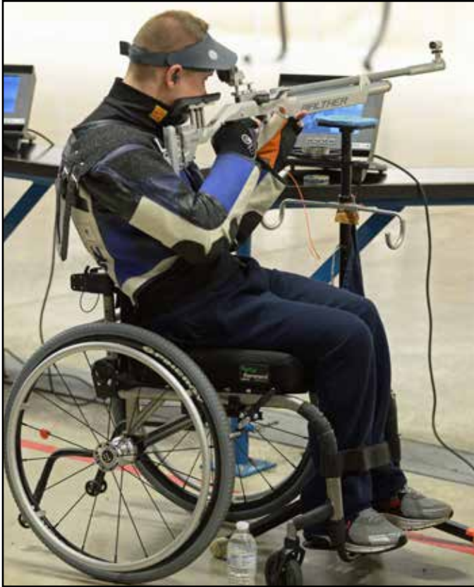
This athlete is firing in an “adapted” standing position for wheelchair athletes. Athletes who use adapted positions approved for IPC SH1 class athletes can compete with all athletes in 3PAR competitions on a relatively equal basis.

3PAR Rules still allow athletes to challenge close shots, but more and more match sponsors are deciding not to allow challenges because they are fundamentally unfair. If challenges are allowed and made, the original computer scan can be rescored, but if the athlete loses the challenge, a two-point penalty must be applied to the score of that shot. Other countries where electronic scoring systems like Orion are used permit the correction of obvious errors, but prohibit rescoring correctly scored shots. German Shooting Federation Rules, for example, state, “only one method of scoring may be used” and that when an electronic vision system is used “the scoring rings may not be used” and “it is not permitted to use a scoring gauge.”