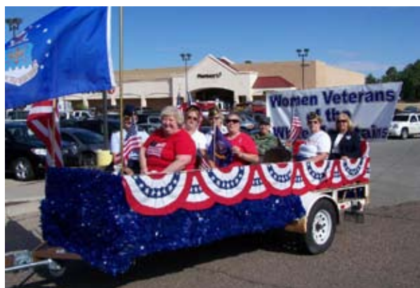
Female Veterans from the White Mountain area participated in the 2009 Fourth of July Parade. They had eight female veterans aboard their first time entry float and are looking to add a lot more for next year's parade. Way to go Ladies!