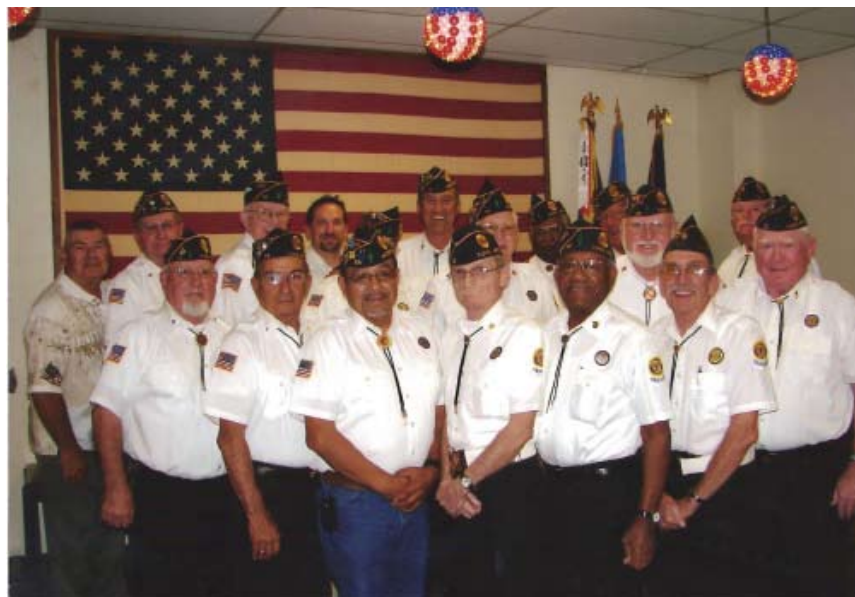
H.H. Donkersely Post #19 Ceremonial Team

The American Legion Post #19 Ceremonial Team met at American Legion Post #56 for its annual dinner on 22 March 2011. In all, 18 members were present along with their ladies. This dinner is held yearly and paid for by donations and contributions. The team is comprised of 26 Legion members (seven are from Post #56). Most are retired military and some are retired members from the civilian community plus members that are still employed.