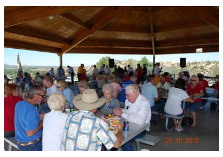
District 8 Legionnaires enjoy a picnic feast at the lake.