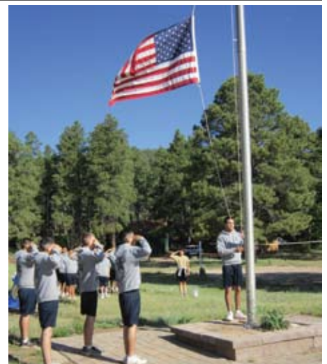
ALLECA Cadets at the morning flag raising

Cadets to check-in, however, we found that the disparity showed us that youth were double scheduling themselves, so I guess that is a good thing. We had 31 Cadets check-in and unfortunately, we had to send a few home; one Cadet fractured his arm when he tripped while running, one Cadet had a previous back injury, and we sent a Cadet home for disciplinary issues.