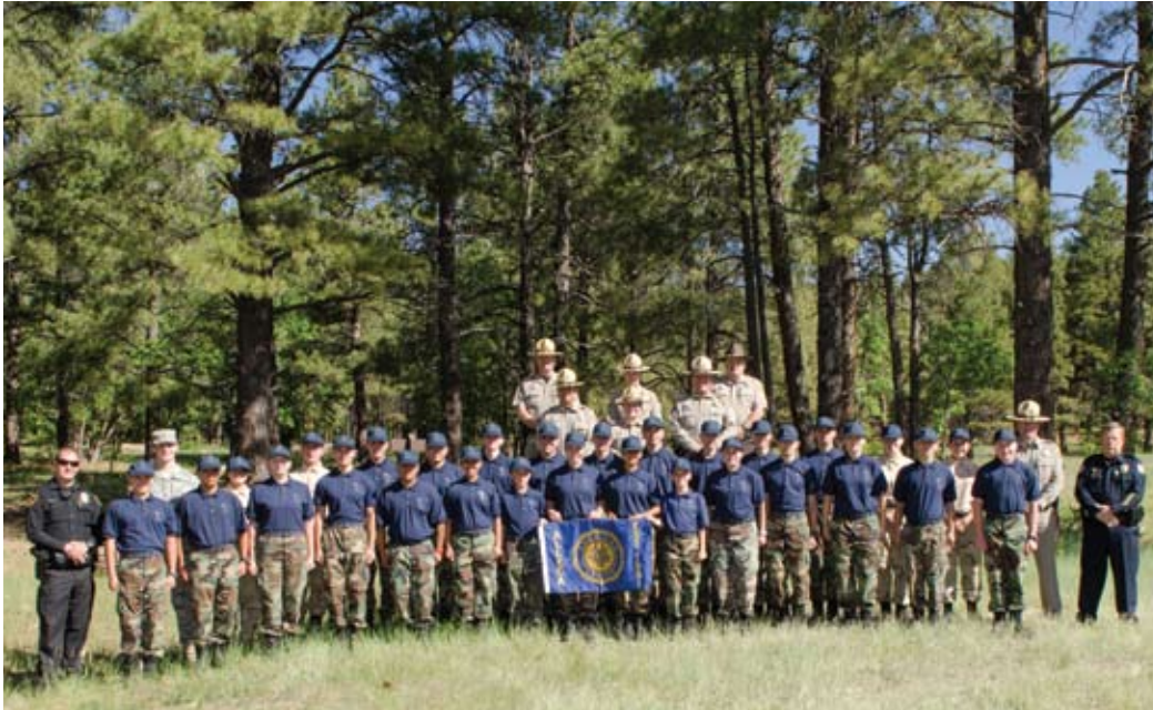
ALLECA Class 2013 in the Cool Pines of Flagstaff

letters from the Cadets you supported will be arriving in the mail soon. A huge thank you goes out to Post #3 in Flagstaff and their Sons of the American Legion for feeding the Staff and Cadets for the first day and during the graduation this year.