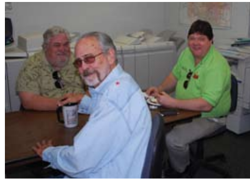
Our S.A.L. Officers hard at "work"