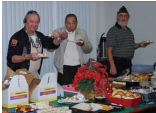
This is good food!!