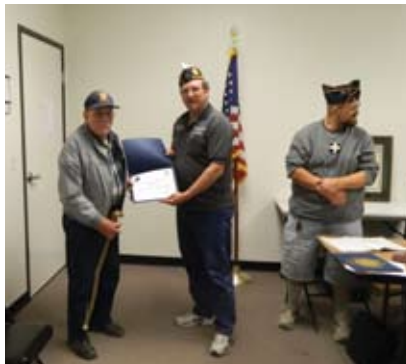
Rulen B. Hancock Post 136-Yucca