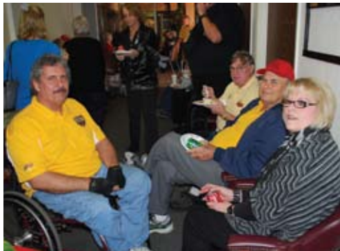
Our Baseball Committee "catching up" on news