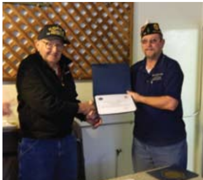
Lawrence J. Gudde Post 88-Dolan Springs