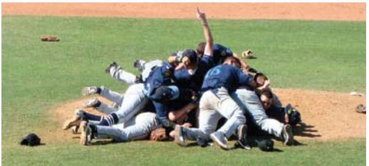
Mounds of joy! Petaluma celebrates their victory.