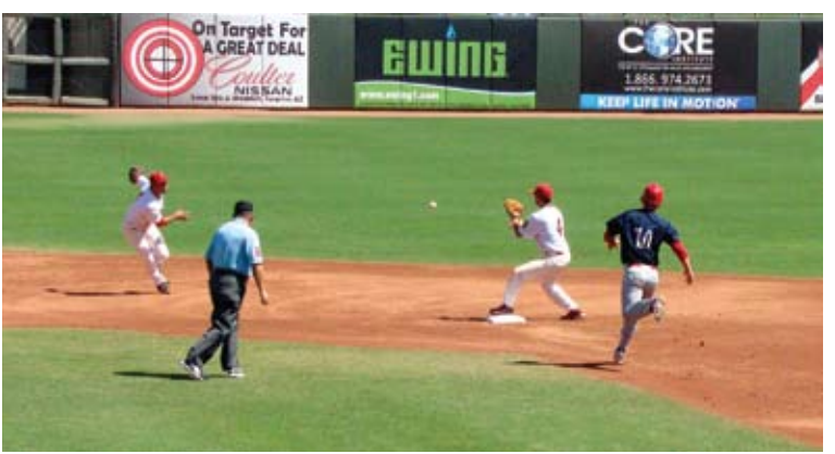
Is it going to be close?