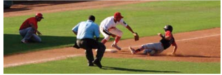
It's a close play at third.