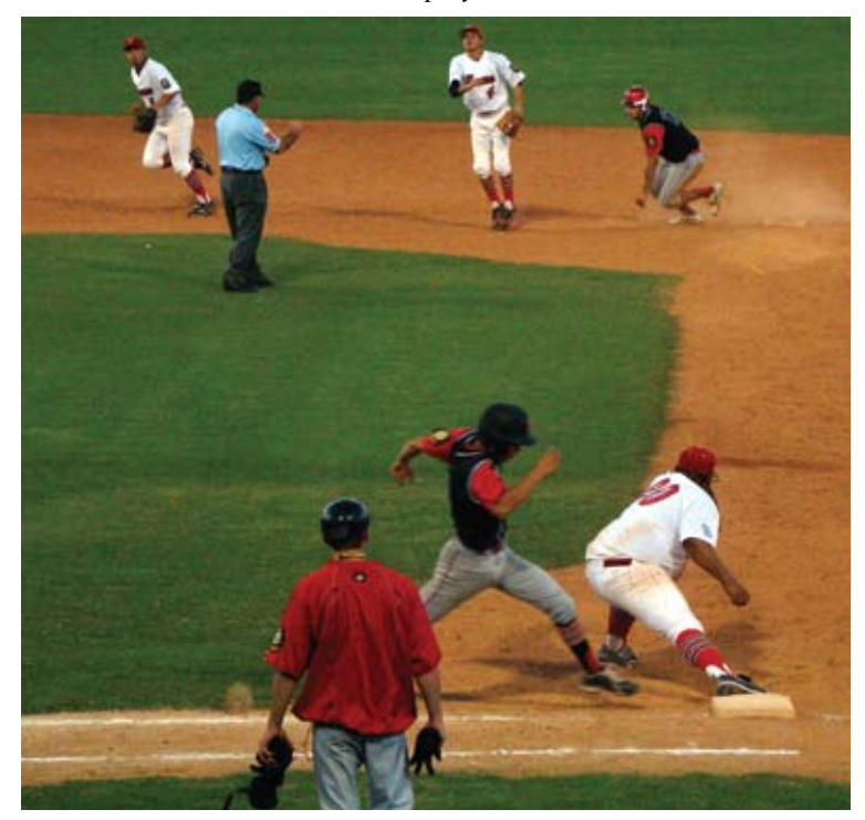
Turning the double play.