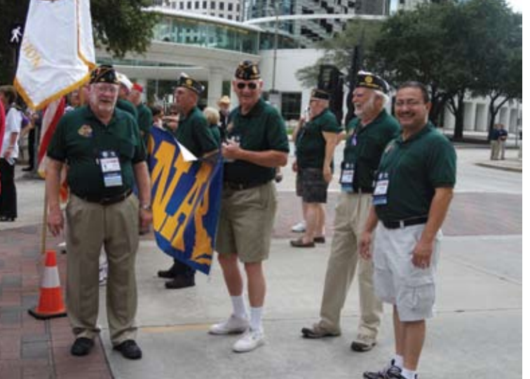
Let's get this parade going...it's HUMID out here!