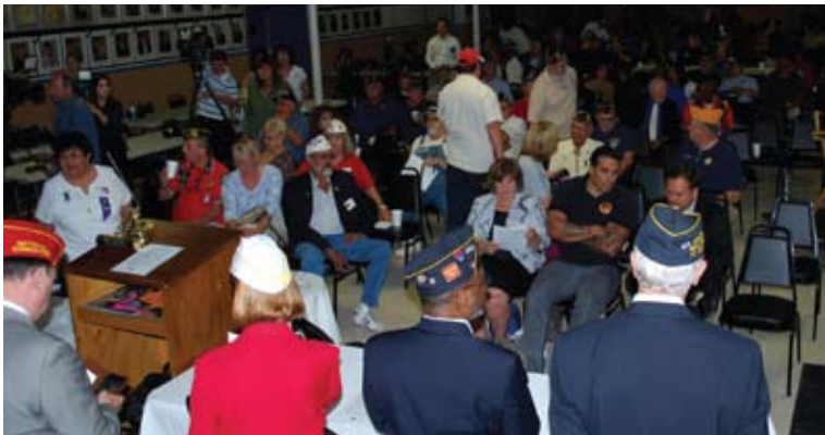
Attendees at the Town Hall Meeting held at Post 41 in Phoenix