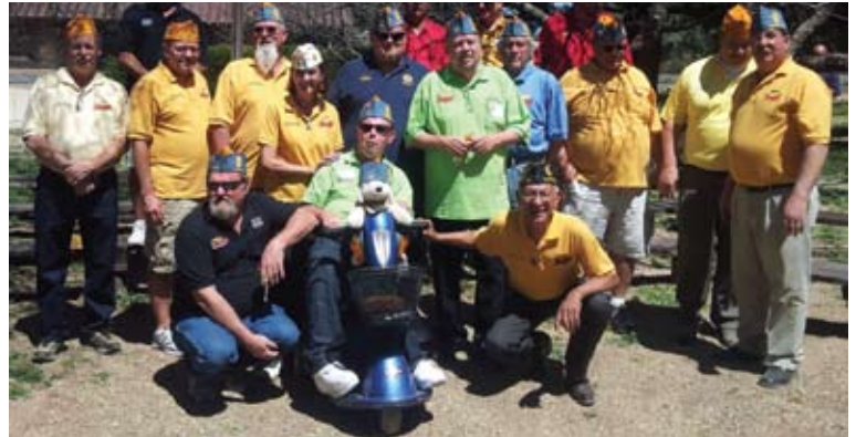
S.A.L. Campout at Deadhorse Ranch in Cottonwood