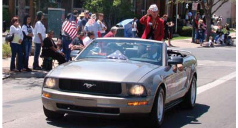
Armed Forces Day Parade in Flagstaff