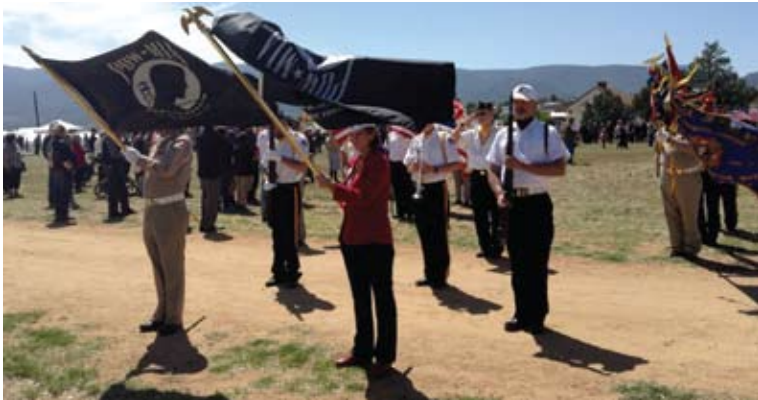
Vietnam Veterans' Recognition Day in Camp Verde