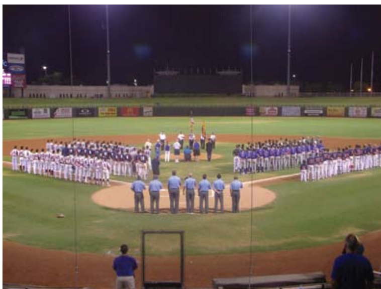
Opening Ceremony, Earl E. Mitchell Post #29-Glendale, Color Guard presenting colors