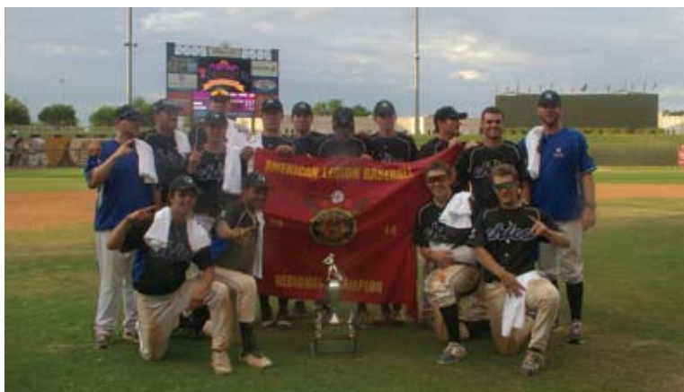
Western Regional Winners from California

"After searching my room and the motel lobby this morning, I realized I had probably tossed my car key (the only one) into the garbage. I was talking to myself as I tried to decide what to do, when a young stranger stepped up and insisted on helping. I went to get another garbage bag as he sorted through that mess piece by piece. He dug through for the next 10 minutes; most of the solid ware was out and only about two inches of liquid and food remained. His hand went back down into that gunk and out comes my car key. This young man is the epitome of what a young man should strive to be."