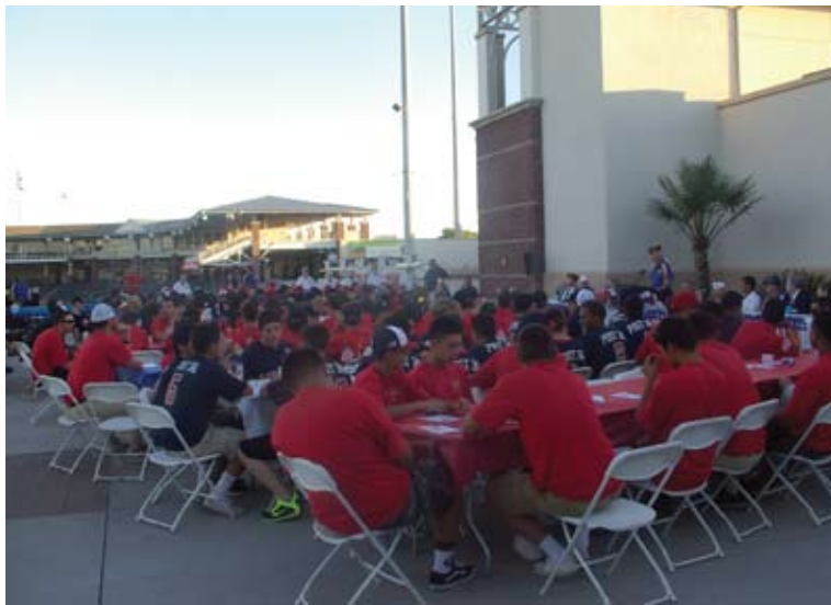
2014 Western Regional Tournament Banquet for the players, coaches and their families.