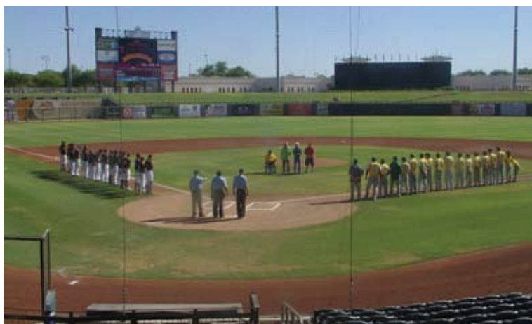
Game 1 Colorado vs Nevada