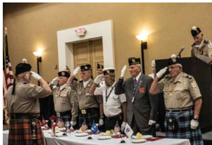
Memorial Service performed by Scottish-American Military Society from Col. Alexander Brodie Post 48-Phoenix.