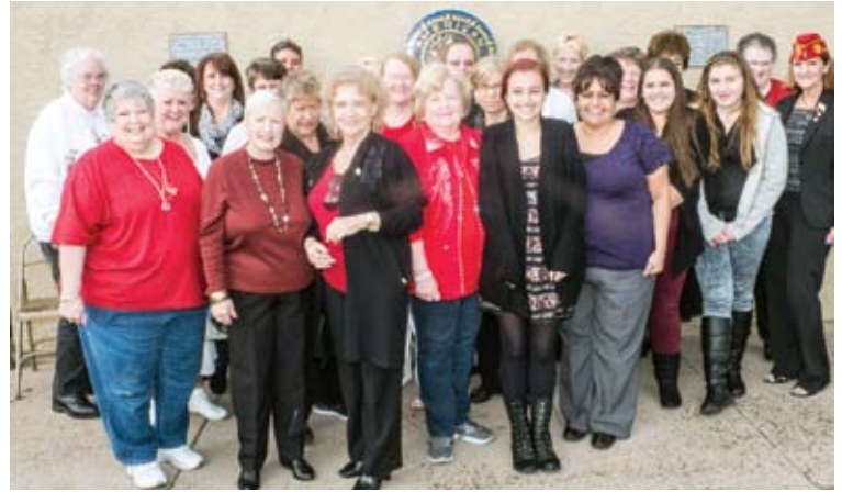
Auxiliary - Great picture showing "just a few" of our Auxiliary members from around the state.