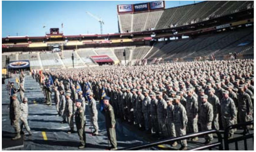
ASU National Guard Muster at Sun Devil Stadium