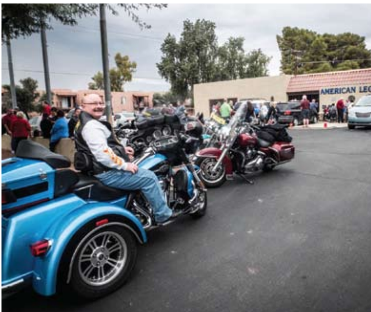
ALR - Quite a few Riders showed up before going on to their quarterly meeting.