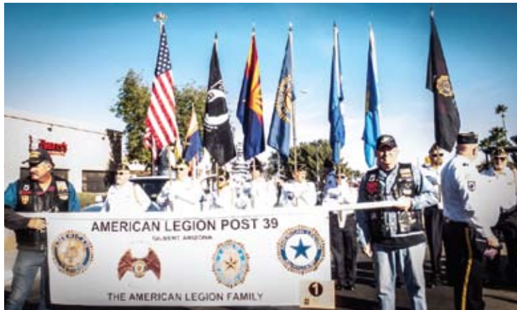
The American Legion Family Post 39 in Gilbert at the Gilbert Days Parade