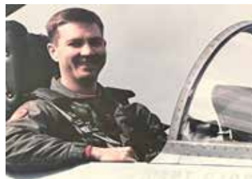
USMC Fighter Pilot, F/A-18

Who Needs "Maverick" when you have "SLAMMER"