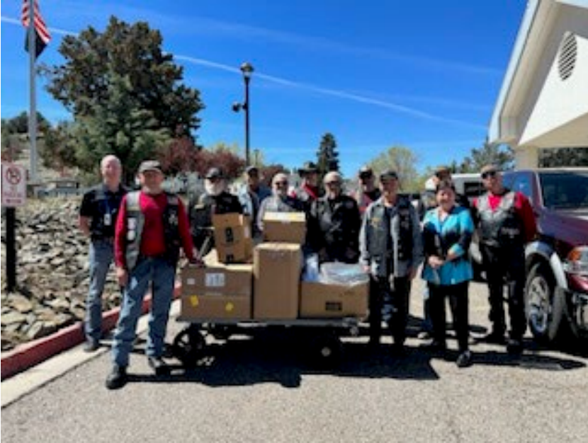
Donation From the American Legion Post 6 Riders - Prescott, AZ More than $1,000 worth of items for our Domiciliary residents