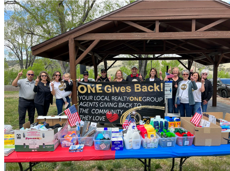
Donation From Realty 1 - Prescott, AZ Cookies, lemonade, music and activities