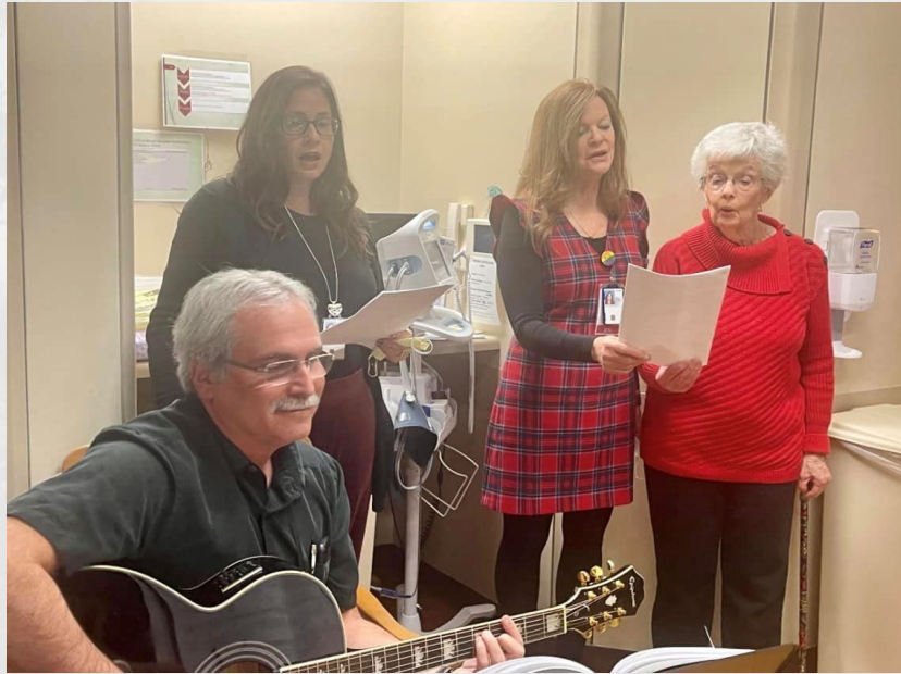
Employee Christmas Carolers