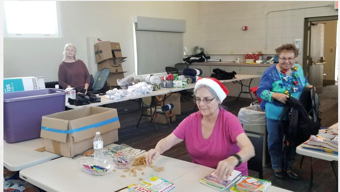
Volunteers make holiday backpacks for Veterans