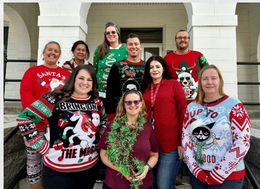
In the holiday spirit!