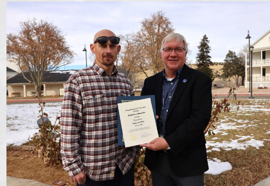
Employee of the Month